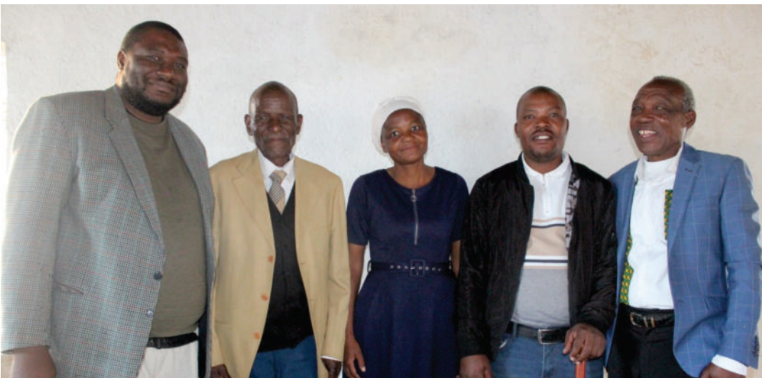
Ramotse Village, Hammanskraal – 15 June 2025

As the golden sun crept over the quiet hills of Hammanskraal, the Zion Star Christiana Church in Ramotse burst to life with the power, pride, and passion of the South African youth. On the eve of Youth Day, a moving and vibrant celebration echoed through the hearts of attendees, capturing the essence of remembrance, resilience, and revival.