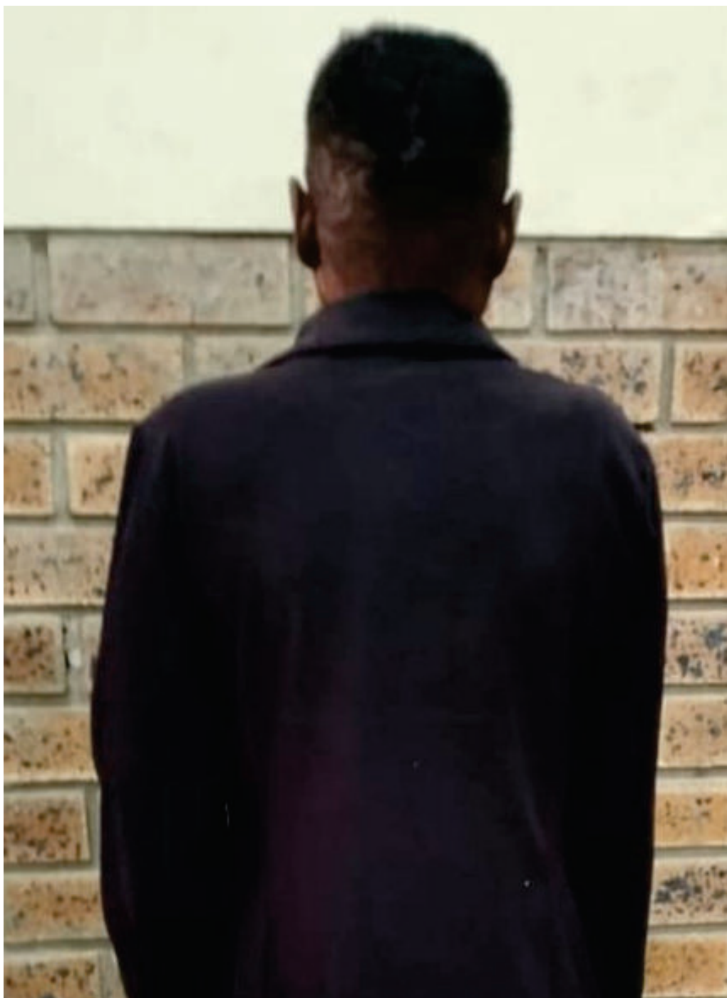
Setshwantsho se se tsentsweng